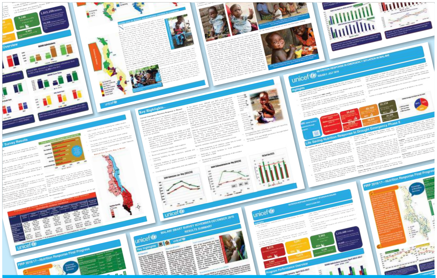
FIG 3. SNAPSHOTS OF MONTHLY NUTRITION BULLETINS